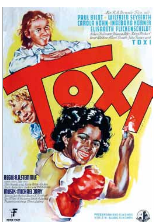
The film "Toxi" premiered in 1952 as a larger group of Afro-German children were entering first grade. The film intended to "promote in a humorous way understanding and love for all Toxis." Like many other publications from the period, however, the film emphasized that these children were "different" and confirmed prejudices instead of breaking them down. The film ends with the child's American father taking her "home."

Later on, immigrants from Spain, Italy, Portugal, and Greece were accepted as "Europeans." For "the Turks" this is still not the case, even if they were born in Germany.