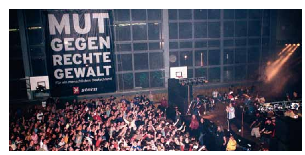
A concert as part of the campaign "Stand Up Against Right-Wing Violence."

Much like in Eberswalde there has been a process of democratization in many places in the former East Germany. Grass roots organizations and a more active, democratically oriented civil society that takes on responsibility for the community have developed. Work against antisemitism, racism, and rightwing extremism remains necessary in the former West as well.