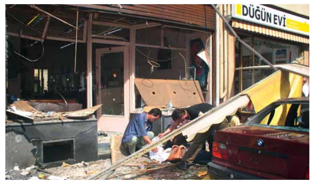
A group of "national socialists" killed nine immigrants and one non-immigrant policewoman between 1999 and 2010. There was significant evidence pointing to the existence of this "national socialist underground," as the group called itself, but police departments and the secret services simply ignored the evidence. Instead, the police investigators repeatedly insinuated that the victims had been involved with some "foreign" mafia. On 9 June 2004, the group detonated a bomb filled with nails on the Keup Street in Cologne. The street is a busy part of the city where many immigrants live. The bomb injured 22 people, some of them very seriously.

Until the mid 1970s, it was primarily former members of the Nazi party that convened in ultra-right parties. Their main goals were to downplay the crimes and glorify the achievements of the Nazi era and to fight against the stationing of Allied troops in Germany. This changed in the 1980s: the right-wing extremist movement became younger, more militant, and more up-to-date. The neo-Nazis started recruiting members from youth scenes such as soccer fans and skinheads. Beyond party conventions and election cam-