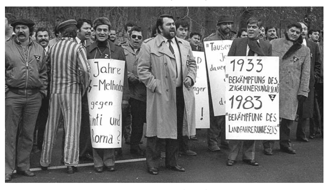
In 1983, 250 Roma demonstrated against the police's profiling of their group. West German courts and police forces kept special "Gypsy files" on Roma, frequently using information from data collection, reporting and sentencing by authorities in the Nazi period.

ma, East Europeans and people who were not white were portrayed as "inferior" and as a "threat to the Aryan race." After 1945, the children of white German women and Black occupation soldiers were immediately considered to be a "problem." The mothers were insulted as "traitors" and "whores," were attacked violently, and were discriminated against in the distribution of food ration cards. German authorities attempted to have the children be given away for adoption in the U.S. or made plans for their later emigration. They justified these policies by arguing that the children would suffer from the weather conditions and from a hostile attitude in the population. Most often, however, the decisive motivation was the notion that "mixed-race" children would present a danger to the general population. As a US-officer