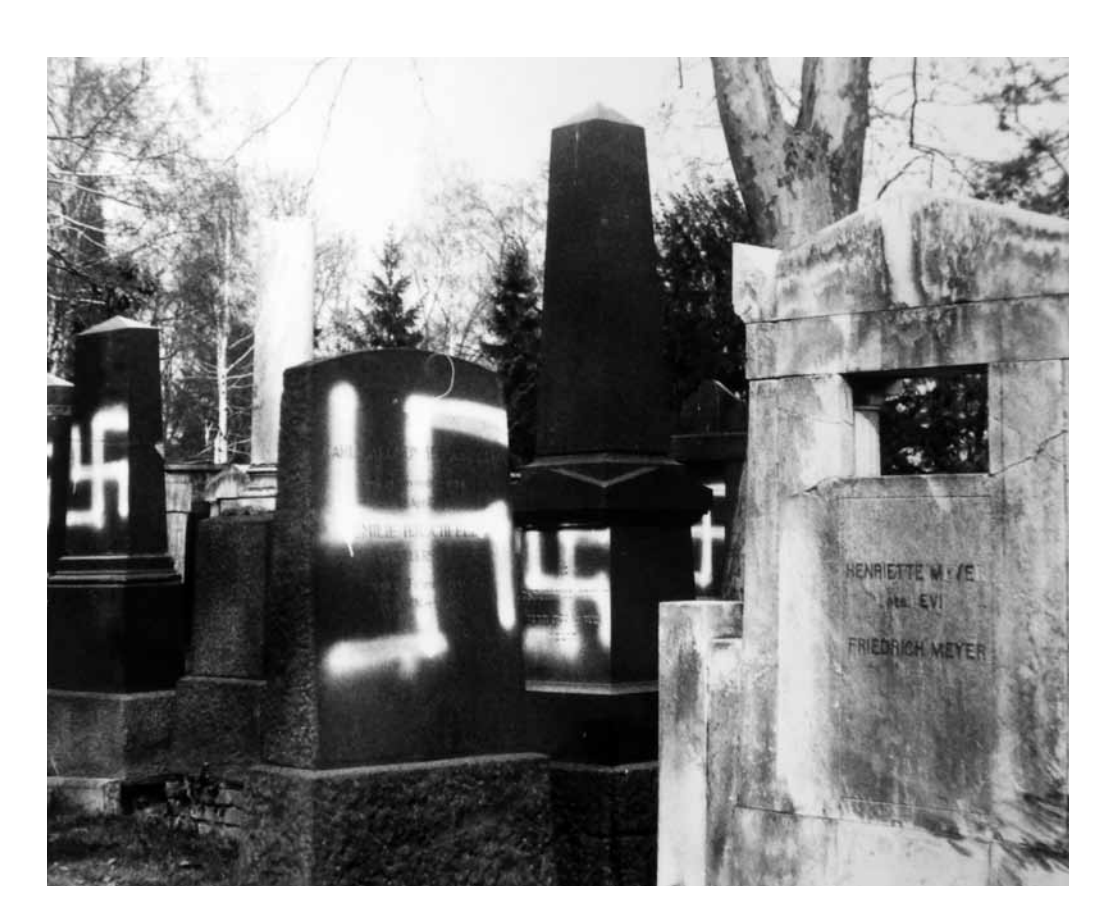
Desecration of the Jewish cemetery in Frankfurt am Main/Rat-Beil-Street, Easter Sunday, March 31, 1975