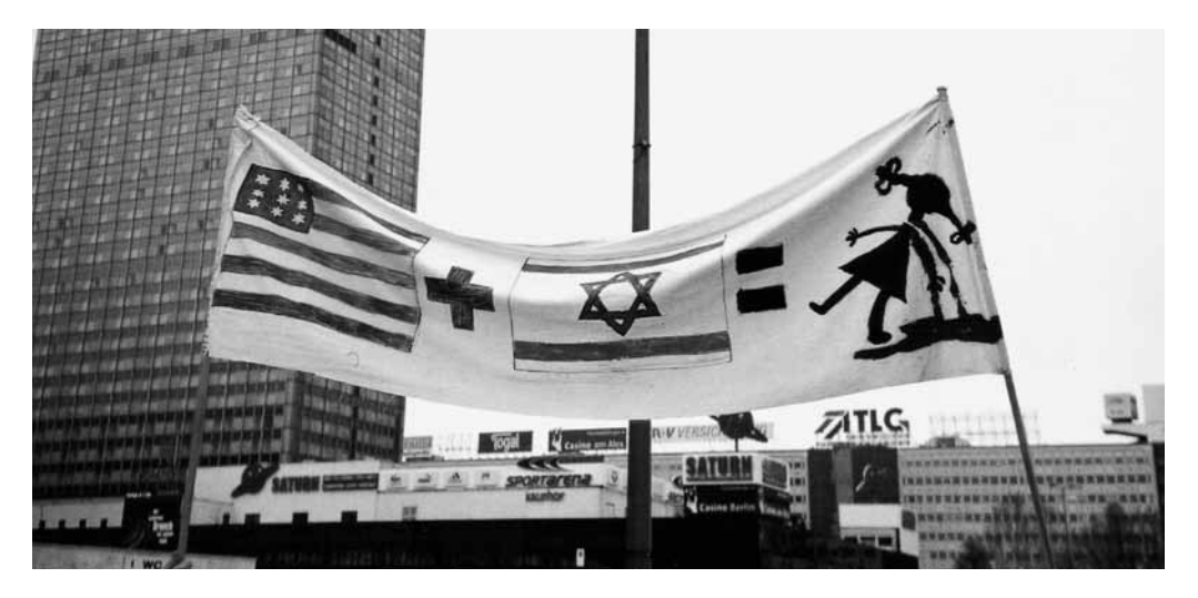
Banner on a demonstration: USA + Israel = Child Murderer. At so-called "peace" demonstrations, signs at times portray Israel as a child murderer, as in this pro-Palestinian demonstration in Berlin in 2002. This harks back to old anti-Jewish accusations of blood libel.

opinion that Israel is carrying out a war of 2006 in Berlin, schoolmates taunted, insulted and threatened a Jewish girl with antisemitic slurs over a long period of time. After an incident in which she was chased and injured, police officers eventually escorted her on her way to school. The Jewish student later changed schools to attend the Jewish high school that receives a considerable number of students who confronted antisemitic attitudes in their previous schools.