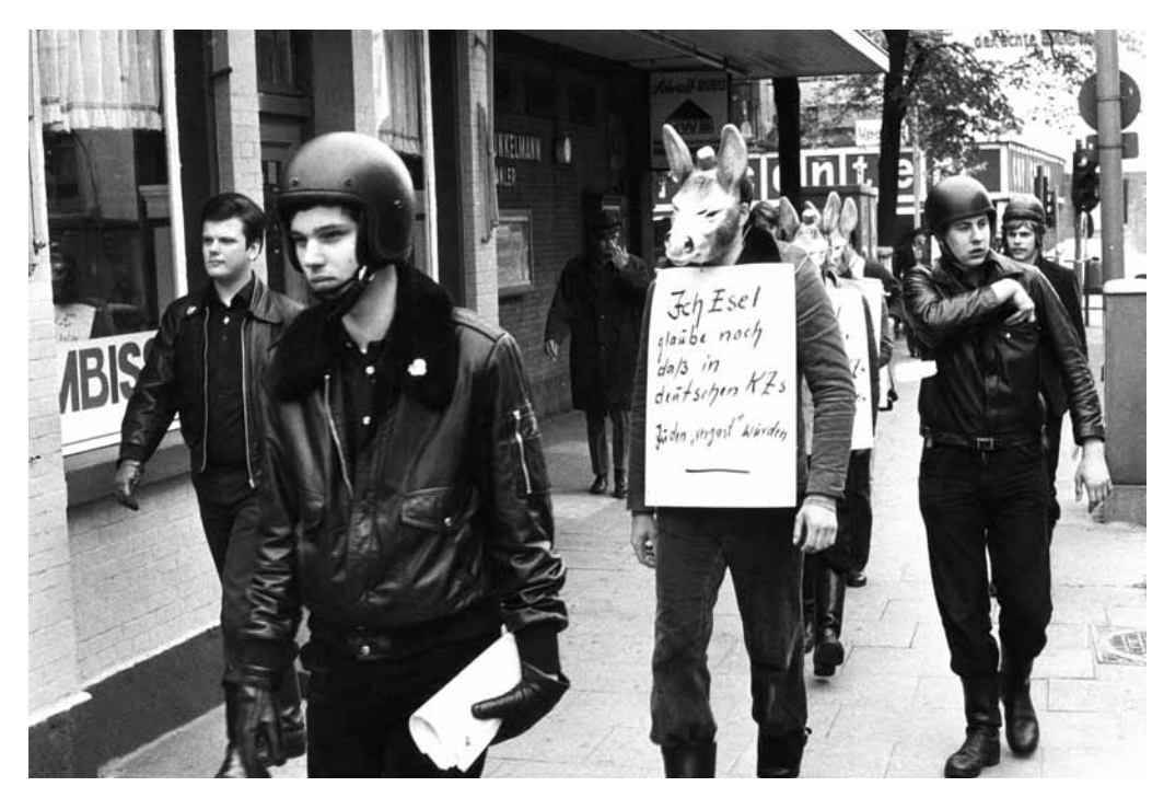
A march by members of the Action Front of National Socialists with signs with donkey masks and signs reading "I am an ass and believe..." in Hamburg on 20 May 1978. Denying the Holocaust and calling it a "Jewish lie" is part of the standard strategy of German neo-Nazis. Holocaust denial is a crime in Germany. In 2010, 60 people faced sentencing for Holocaust denial, but only two of them were given prison terms.

Right-wing extremists are interested in the politics of history. Because they want to establish a system similar to that of the Nazis, they are interested in denying, minimizing, or justifying the crimes of the Nazis. From the start, at the center of these efforts has been the denial of the historical facts of the Holocaust. With pseudoscientific arguments