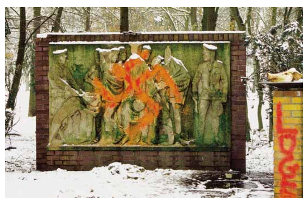
The Memorial for the Victims of the Death Marches 1945 in Wöbbelin, in Germany's North East, was heavily damaged in 2002. The heads and arms of the sculptures representing concentration camp inmates during the death marches were removed. On the column, a swastika was painted with the words "Jew" and "lie." A pig's head was placed on the memorial. The culprits were never found. Restoration was completed in May 2003.