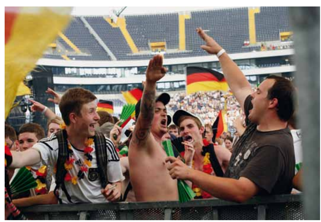
The Nazi salute in front of the German flag during the Soccer World Cup 2010. Although Germany's flag symbolizes a democratic and republican tradition, at times certain people show Nazi symbols during patriotic celebrations – even though such symbols are banned.

most recently with the 1992 riots in Rostock, during which regular citizens participated in racist pogroms or cheered them on. Almost half of all Germans believe that there are too many "foreigners" living in Germany. In representative polls, close to a third of respondents agree with the idea that immigrants only come to Germany to abuse the welfare state. Since the end of the 1990s there have been increasing public debates about immigration. As the possibility of allowing doublecitizenship was being considered in 1999, there were angry protests with racist undertones. And there is a growing fear in mainstream society of being "overrun by foreigners," a fear that does not correspond to the actual number of "foreigners" living in