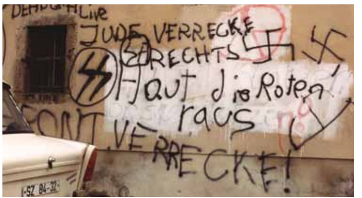
"Judah Perish, SS." The Nazis used the phrase "Jude verrecke" [Judah perish]. This anti-Jewish slogan was sighted in the eastern German city of Wurzen shortly after the fall of the Berlin Wall.