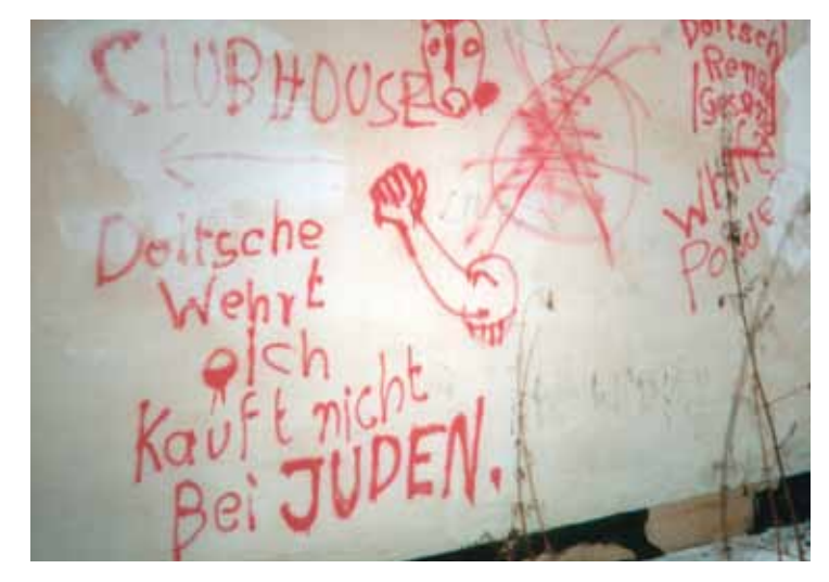
"Germans, protect yourselves. Don't buy from Jews!" This graffiti echoes Nazi propaganda and was found in 1999 near Zwickau, in Eastern Germany.