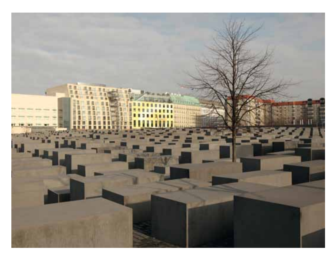
The "Memorial to the Murdered Jews of Europe," large and centrally located in Berlin, has become a major tourist attraction since its inauguration in 2005. This memorial is internationally recognized as a symbol of German society's earnest confrontation with the Nazi crimes.