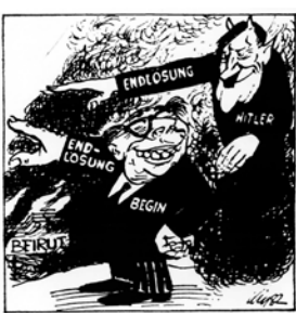
Equating the Lebanon War with the Holocaust