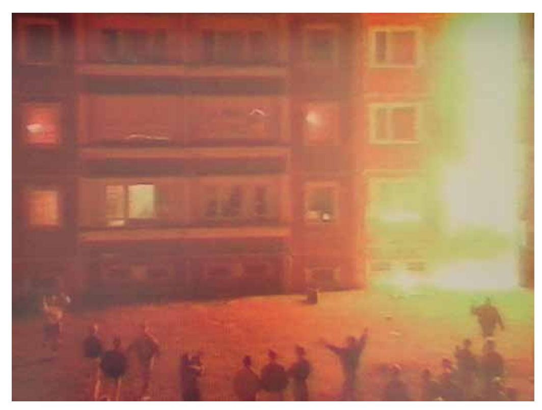
Arson-attacks on a building housing Vietnamese workers in the East German city of Rostock from the 22<sup>nd</sup> to the 25<sup>th</sup> of August 1992. Young German residents and neo-Nazis who had traveled there threw the firebombs. Thousands of onlookers cheered them on.

faced persecution, torture or death, international contracts often made it impossible to deport them. Conservatives and right-wing extremists claimed that the high number of rejections meant that the asylum laws were being misused and spoke of "bogus asylum seekers," warning of a "flood" of "economic refugees." There was a wave of racist violence in Germany in 1991 and 1992. For example, in Rostock in August 1992, neo-Nazis, who had traveled there, as well as neighbors attacked buildings where Roma refugees and Vietnamese contract workers lived with stones and explosives. The attacks continued for five days to the applause of several thousand local onlookers. Lacking police protection, the fire department could not put out the fires. The police let the mob have its way but arrested people who were protesting against the racist