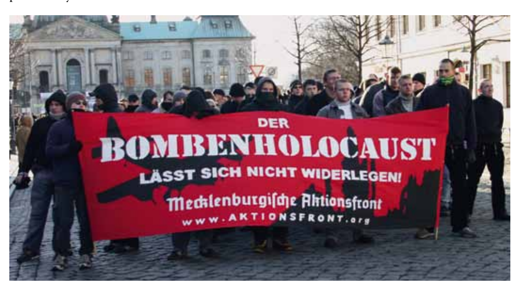
Neo-Nazi demonstration in Dresden in 2005 commemorating the Allied bombing of Dresden. Even today, many in Germany regard the "Allied bombing war" as a war crime. Not only right-wing extremists equate the bombing of Dresden to the Holocaust.

the crimes of the Nazis seem "normal" and thus to be able to promote a positive view of German history. Right-wing extremists protest consistently against depictions that show that German society as a whole was involved in the murderous actions of the Nazis and not just a small group. Many people find this knowledge uncomfortable because it raises questions about what their grandparents and great-grandparents did in the Nazi era.