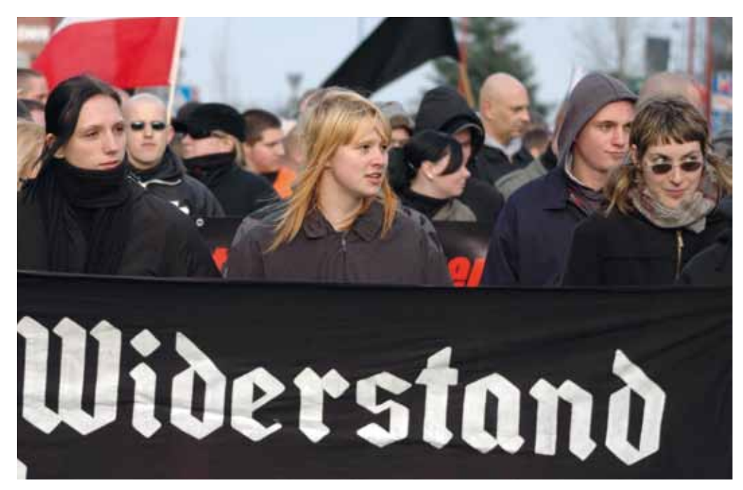
In the 21st century, the number of women in the neo-Nazi scene has been growing. They are active as campaigners and street-fighters, musicians, mothers involved in child-care institutions, in the social professions, or on the Internet.