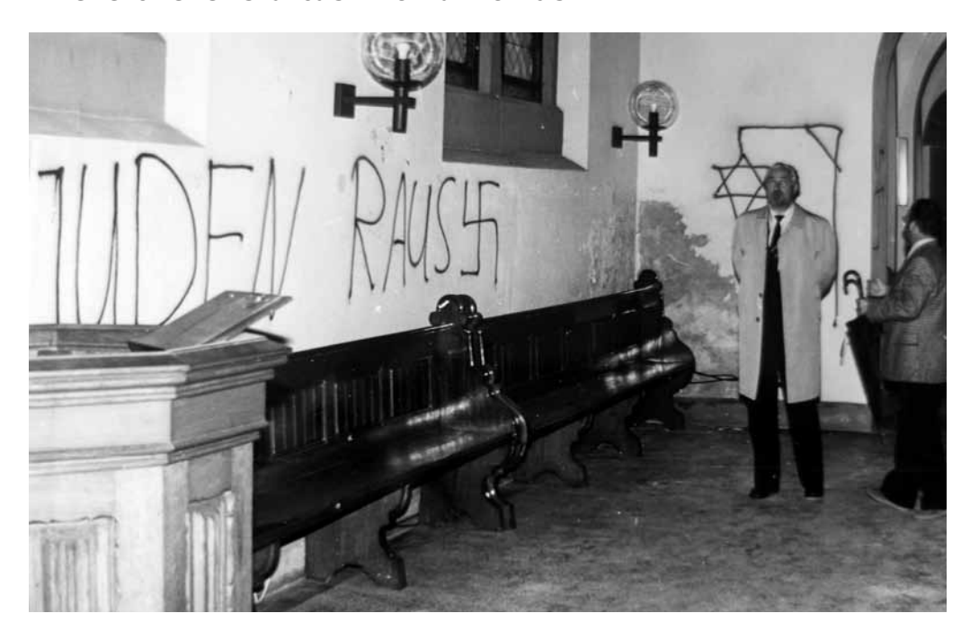
Desecration of the funeral hall at the Jewish cemetery in Giessen, October 12, 1981

National Socialism may have been vanquished in 1945, but antisemitic attitudes persisted in the German population. In studies carried out between 1946 and 1952, one third of the population showed strongly antisemitic attitudes, while another third exhibited partially antisemitic tendencies. The younger generations, molded by their experiences during the Nazi period, were found to be most stridently antisemitic.