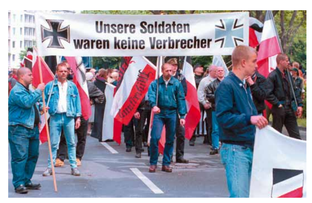
Neo-Nazi demonstration against an exhibition showing, for the first time to the public at large, the participation of regular German soldiers in genocide. Some conservatives joined in the protest. The exhibition was attacked with explosives in 1999.