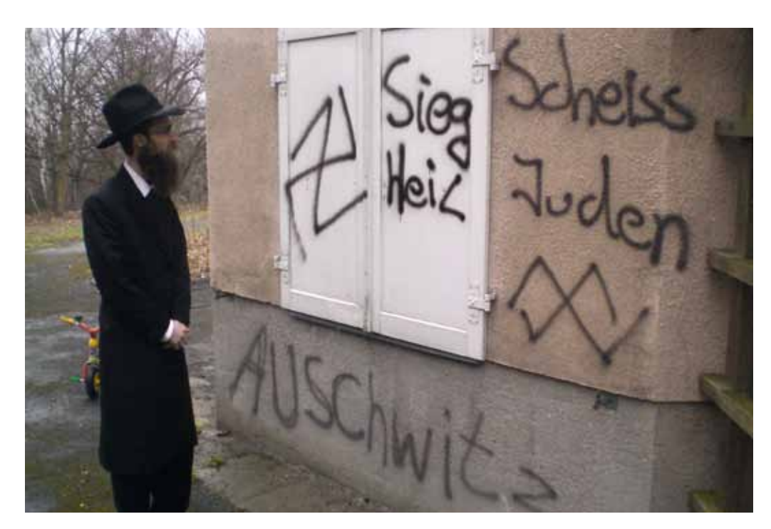
In February 2007 in Berlin, a Jewish kindergarten was attacked overnight. They spray-painted swastikas and slogans like "Juden raus" (Jews get out), smashed in a window and threw a smoke bomb into the building, which did not go off. Photo: Jewish kindergarten Berlin