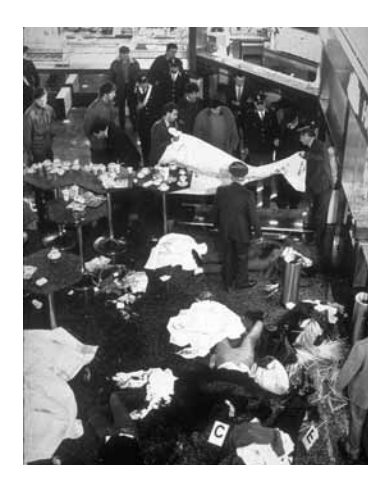
The Abu Nidal group attacked the check-in counter of the Israeli airline El Al on December 27, 1985 at the airport in Rome. Simultaneous attacks in Vienna and Rome killed 20 people and heavily injured 120.