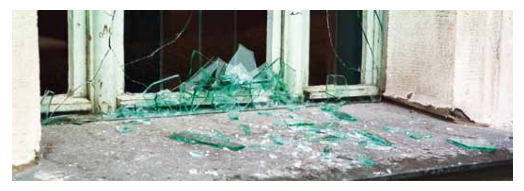
On the night of October 6th, 2000, unknown persons destroyed several windowpanes of the Synagogue on the Fränkelufer in Berlin.

Graffiti spotted in November 1991 in Halle (former East Germany): "Russians, get out!" and "Gas the Jews." The district failed to remove the graffiti for nine months.