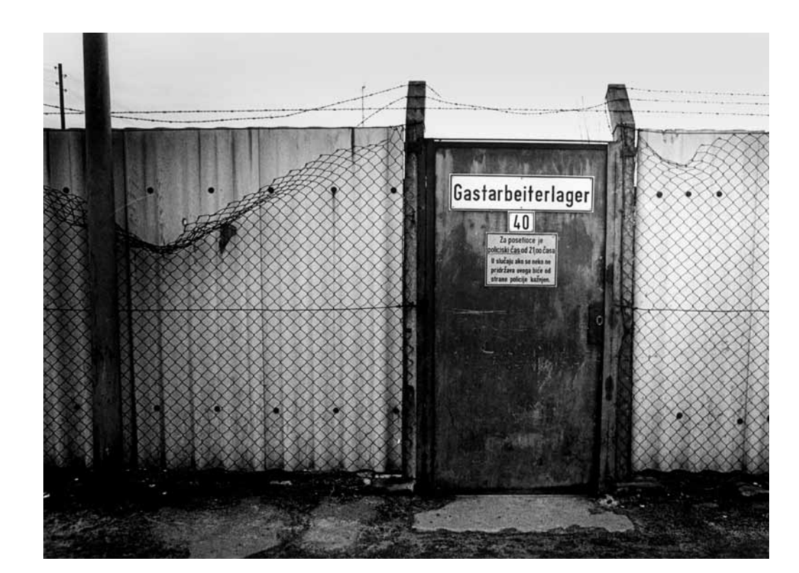
Some foreign workers were housed in camps like this one in Braunschweig well into the 1970s. As the name "guest worker" shows, their integration was not welcome; instead, they were segregated. There were repeated attacks on buildings that housed "foreigners."